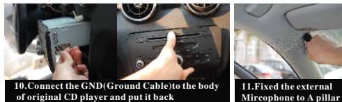
10.Connect the GND (Ground Cable) to the body of original CD player and put it back 11.Fixed the external microphone to A pillar