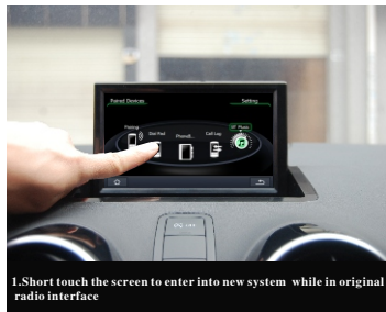
1.Short touch the screen to enter into new system while in original radio interface