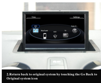
2.Return back to original system by touching the Go Back to Original system icon