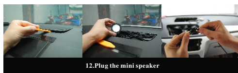
12.Plug the mini speaker