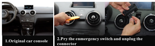
1.Original car console 2.Pry the emergency switch and unplug the connector