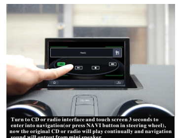
Turn to CD or radio interface and touch screen 3 seconds to enter into navigation (or press NAVI button in steering wheel), now the original CD or radio will play continually and navigation sound will output from mini speaker.