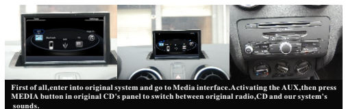
First of all, enter into original system and go to Media interface. Activating the AUX, then press MEDIA button in original CD's panel to switch between original radio, CD and our system's sounds.